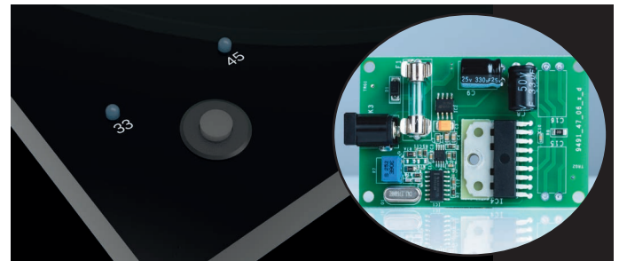
Electronic Speed Switch between 33/45 RPM DC/AC motor control board for best speed stability

For the drive system, where most alternative products may use un-regulated DC motors with wide speed fluctuations, the T1 Phono SB features our proven system of an electronically regulated, precision-speed AC motor. The T1 Phono SB also comes with electronic speed switching between 33 and 45 RPM. The result is a low-noise, stable drive system for the turntable.