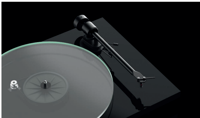
One-piece aluminium tonearm Robust and stiff construction for pure sound fidelity

Supplied with an Ortofon OM5e Moving Magnet cartridge, featuring an elliptical diamond stylus tip; this is a true hi-fi playback system with no corners cut.