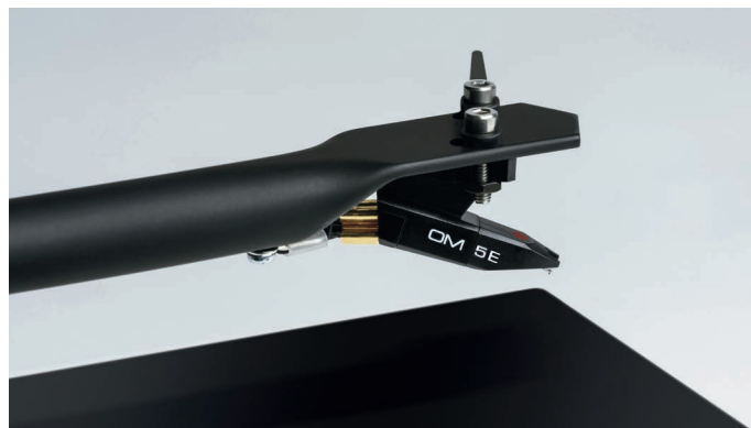
High-quality Ortofon OM5e Moving Magnet cartridge with elliptical stylus tip

The T1 Phono SB is then finished with super shielded, semi-symmetrical, low-capacitance phono cables, purpose-designed by Pro-Ject – not off-the shelf RCA cables. There is also a dust cover for extra protection and a felt mat to protect your records.