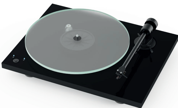
Superb build-quality, stylish looks and audiophile sound Precision CNC'd plinth and heavy zero-resonance glass platter

The stylish CNC-machined plinth, available in High Gloss Black, Satin White or Walnut finish, features no plastic parts and is carefully manufactured to ensure there are no hollow spaces inside, therefore avoiding unwanted vibrations within the chassis.