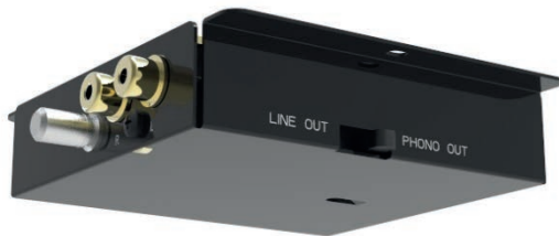
Built-in phono stage Switchable phono/line output

The T1 from Pro-Ject Audio Systems is the first T-Line turntable, aiming to deliver true high-fidelity sound on a limited budget. Boasting premium materials, stylish aesthetics and a rich, lively sound, the extensive development process has ensured that there has been no compromise in the sound performance when achieving such an affordable price. Compared to the base T1-model, the Phono SB version includes a built-in, Pro-Ject designed, high-quality phono MM stage and an electronic speed switch between 33 and 45 RPM.