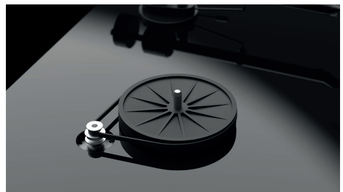
Ultra-precise electronically regulated motor Immaculate speed stability and accuracy

In the T1-line, the motor drives a belt-system, attached to a newly designed sub-platter, which is mounted into an ultra-precise 0.001mm main bearing with a hardened steel axle and brass bushing – just like our coveted Essential III turntables. Alongside the chosen motor system, the T1 is therefore able to ensure a smooth, anti-resonant rotational platform for the tonearm and cartridge to ride across.